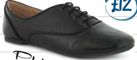
Elda 0.202.271 Size 3x9