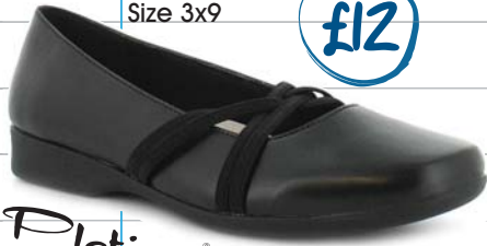
Jody 0.202.265 Size 3x9