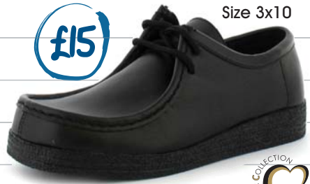
Tlc Aries 0.202.971 Size 3x10