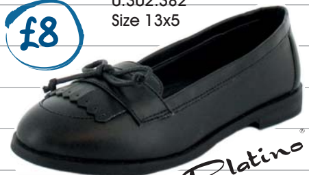
PL Annabel 0.302.382 Size 13x5