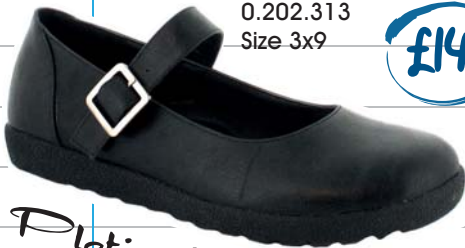
Molly 0.202.313 Size 3x9